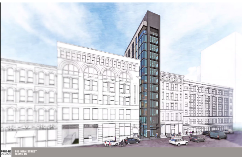
↑ Exterior view of Elsey Partners planned “Pod-Style Hotel” on 188 High St

The team also faced questions from the Council on comparative examples, property dimensions, and design choices. The Council decided to hold an executive session following the public meeting to discuss the project further.